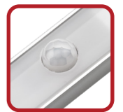
PIR Motion Sensor Manufactured with PIR motion sensor for touch-free operation