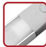
Direct Feed Simple direct feed function