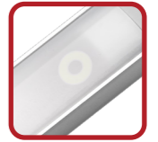
On/Off Touch Switch Manufactured with touch sensitive on/off switch