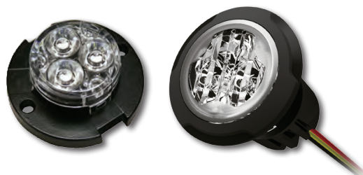
SM3 Ø46.7 x 26mm (D) RM3 Ø36 x 39mm (D)